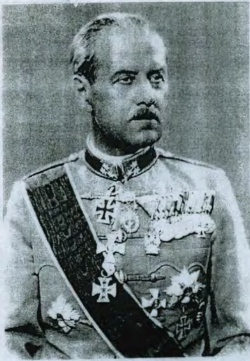
VITÉZ GÉZA LAKATOS COLONEL GENERAL, PRIME MINISTER