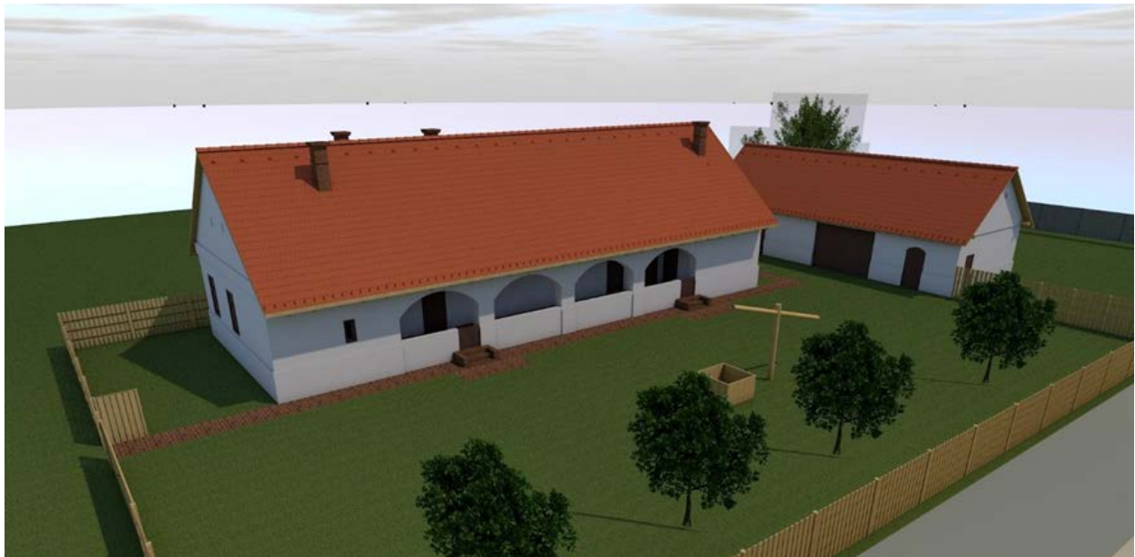
The planned gendarme garrison building and stable at ÓNTE.

The communist regime wanted to eliminate the gendarmerie by all means, for they considered the gendarmerie an obstacle to their attaining full power. Therefore, they claimed the gendarmerie collectively guilty. Later they justified this political decision by blaming the gendarmes for the